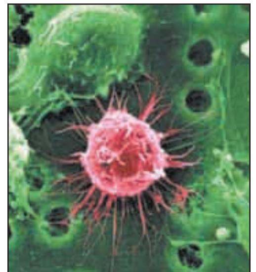
Color-enhanced scanning electron micrograph (SEM) of a stem cell collected from human bone marrow.

Read Birmingham Medical News Online at www.birminghammedicalnews.com